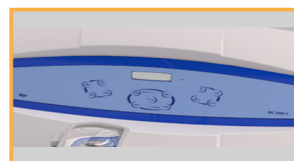
Clear arrangement of the buttons and easy to read two-line display