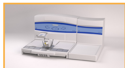
Cryo module can be arranged to the right or to the left