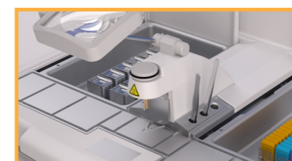
Dispensing area with touch plate or footswitch, light and forceps support