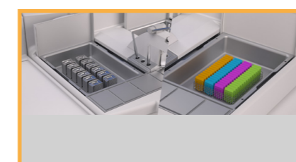
Removable trays for storage of cassettes and molds. Surplus paraffin is drained into waste, removable drawers.