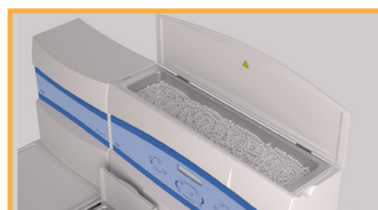
Capacity up to 5 l