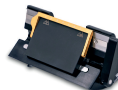
Knife carrier ME