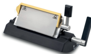
Knife carrier MR