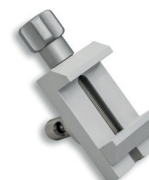
Standard specimen clamp