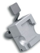
Universal specimen clamp